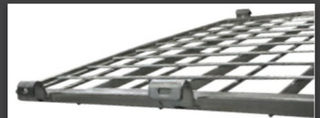
RCR007 | Suits RCR006