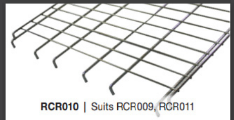
RCR010 | Suits RCR009, RCR011