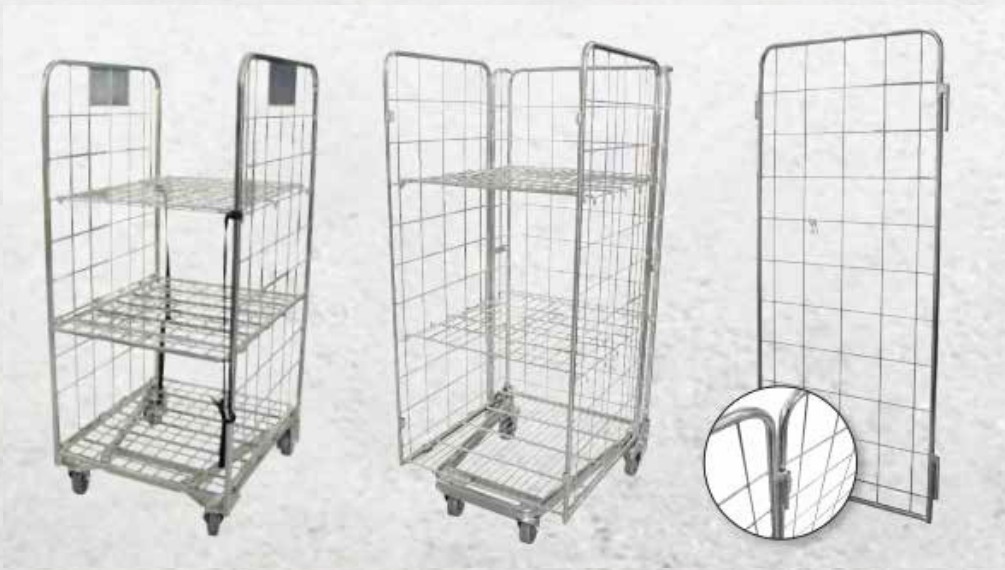
RCR006 WITH SHELVES: RCR006 with RCR008 light duty shelf (top) and RCR007 heavy duty shelf (bottom).

All of these accessories can be added and removed from your cage as needed, allowing you to create your own modular roll cage system.